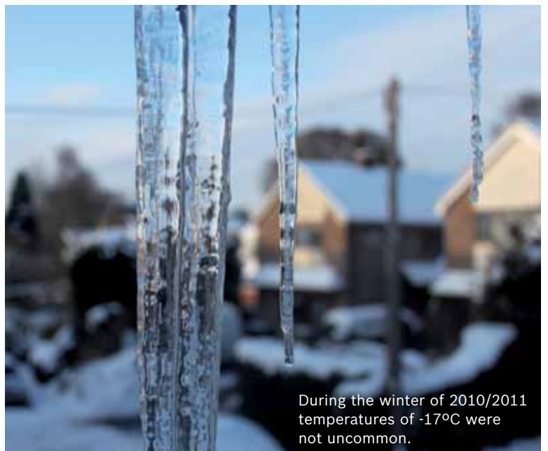
During the winter of 2010/2011 temperatures of -17^{\circ}\text{C} were not uncommon.